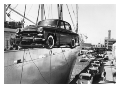
Toyota begins exporting automobiles to the U.S. (1956)