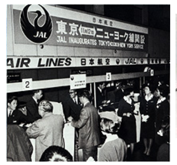
Japan Airlines begins NY to Haneda service via Honolulu and San Francisco (1966)