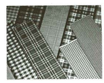
Nichimen's large scale exportation of Japanese Synthetic Fiber Textiles (Late 1960s)