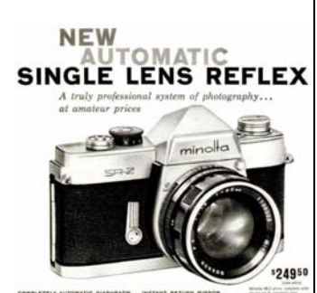
Minolta Corporation opens (1959)