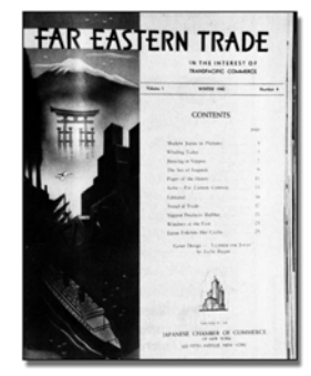
Publication of Far Eastern Trade, a quarterly journal, which aims to dispel outmoded views about Japan (1939)

150 Cherry Trees Given To City by Japanese