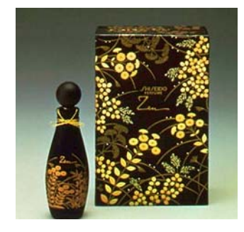
Shiseido Cosmetics America begins selling cosmetics at Macy's department store. Shieseido introduces Zen , its first fragrance developed specifically for the overseas market (1965)