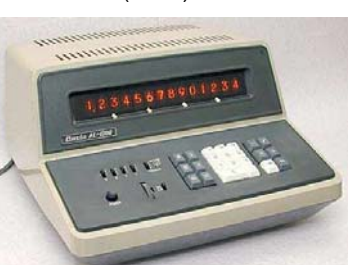
Casio releases the world's first programmable electronic desktop calculators with program (AL-1000 series) (1967)