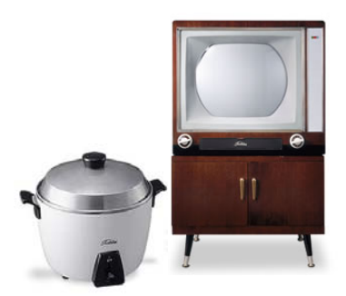
Toshiba America opens (1959)